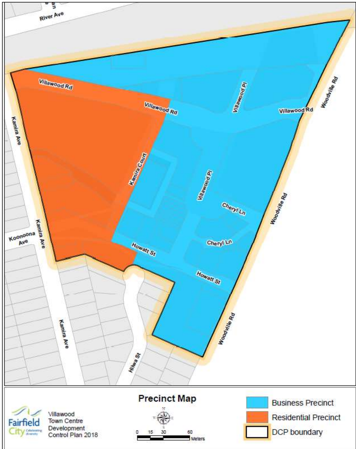
Figure 2. Villawood Town Centre DCP – precinct map

The plan is focused on Villawood Place as the main activated retail space, together with a strong north / south connection to the railway line and an east / west connection that will link new and existing residential development to the Town Centre. The desired redevelopment for Villawood also describes to provide new community facilities, medium to high density, social, affordable and private housing, active safe streets and improved connections throughout the Town Centre.