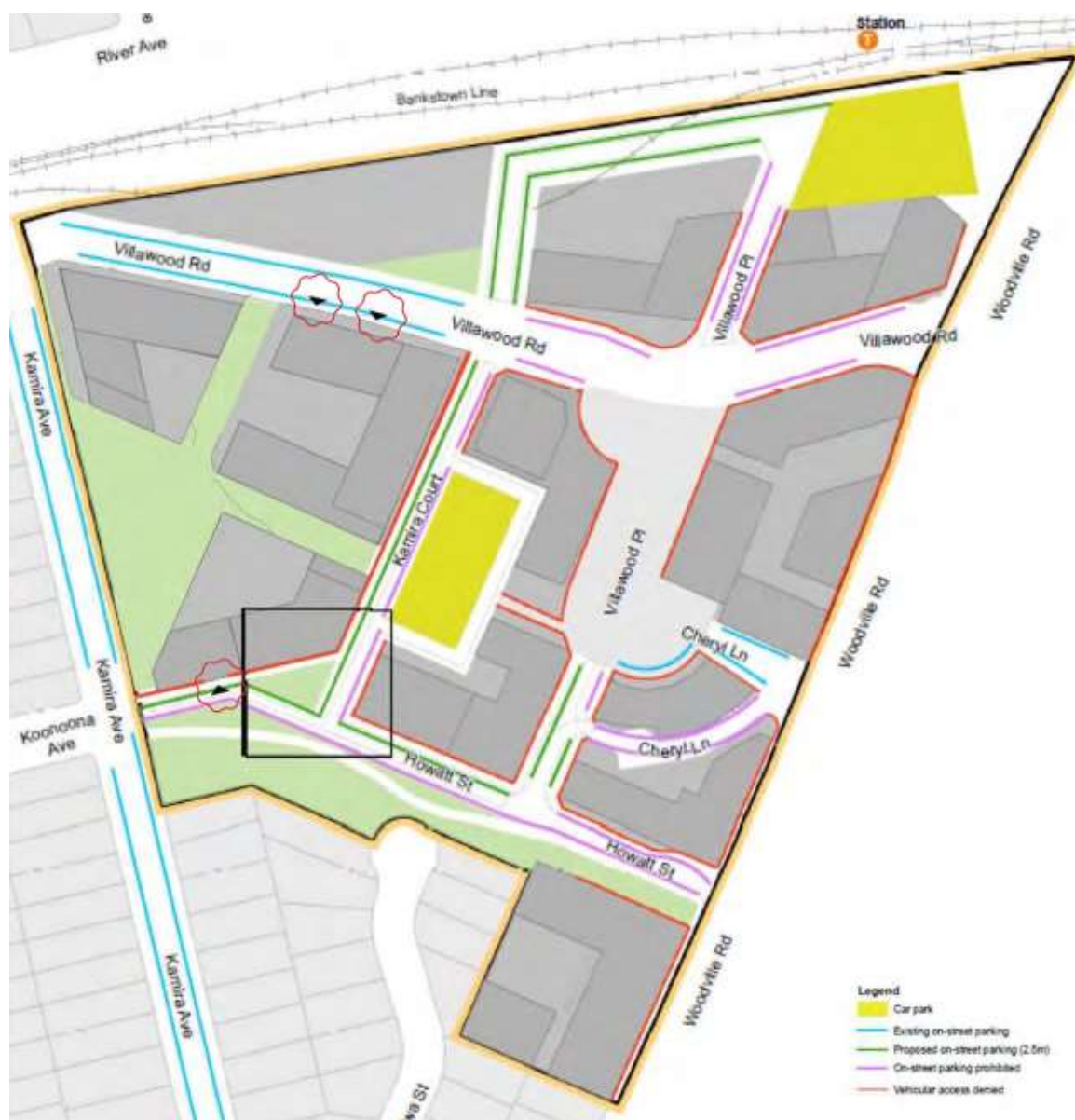
Figure 6. Vehicular Access and Car Parking in Villawood Town Centre