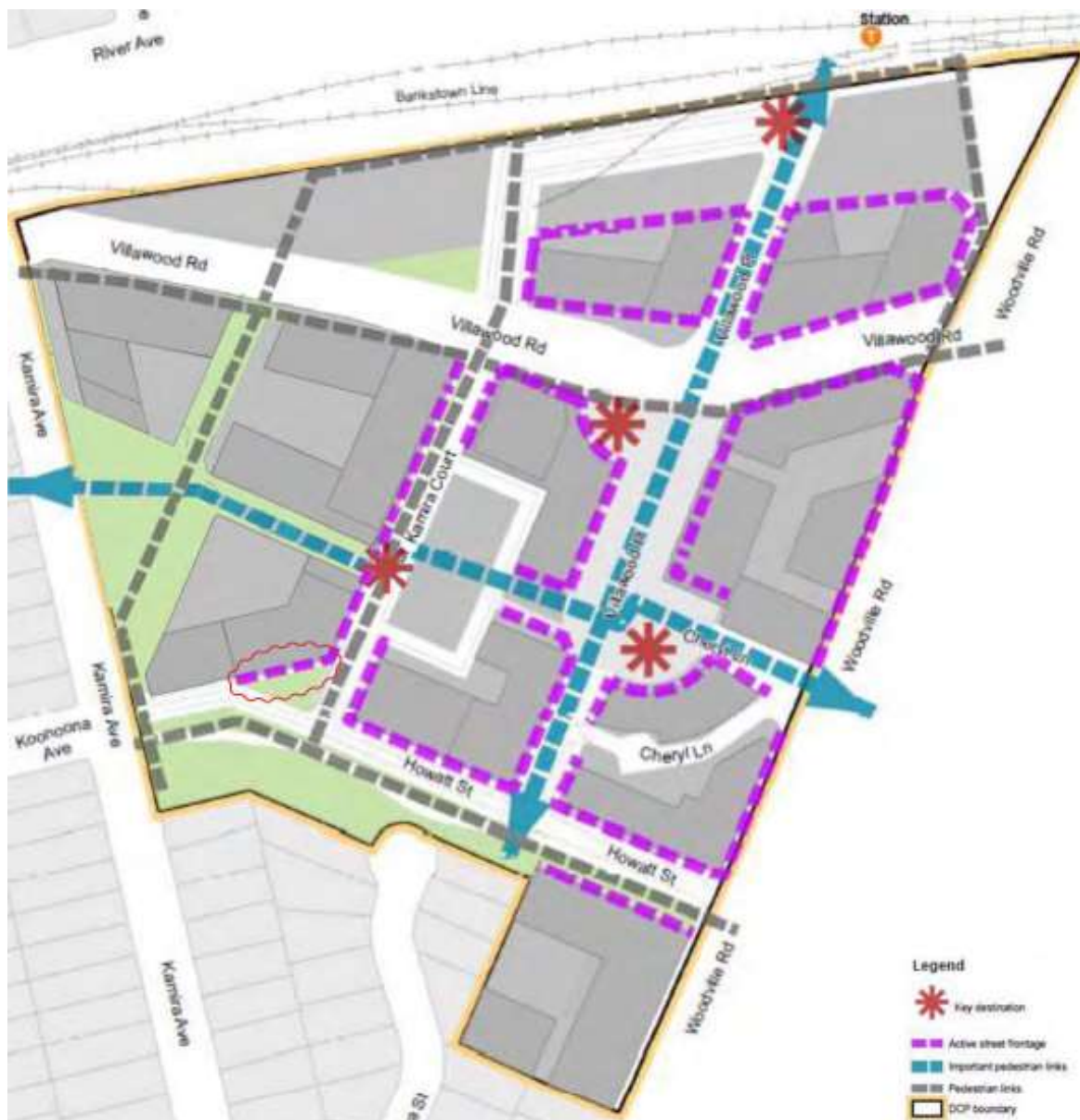
Figure 7. Active street frontage and pedestrian connectivity