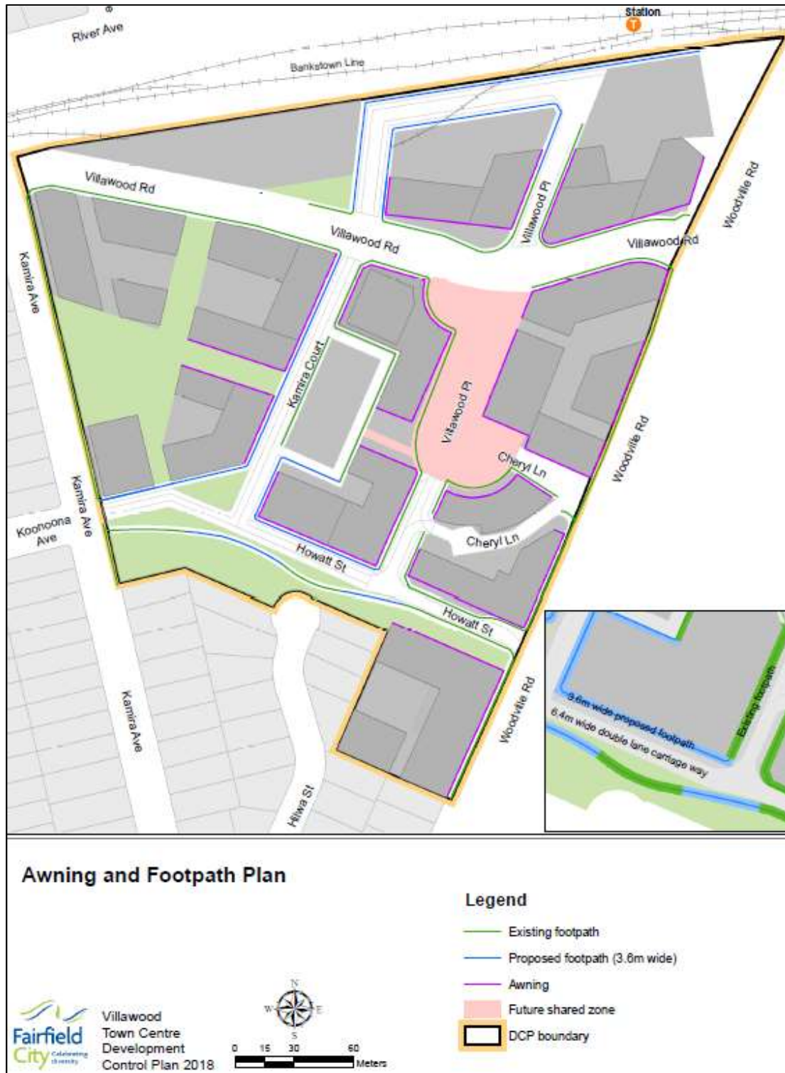
Figure 9. Awning and Footpath Plan