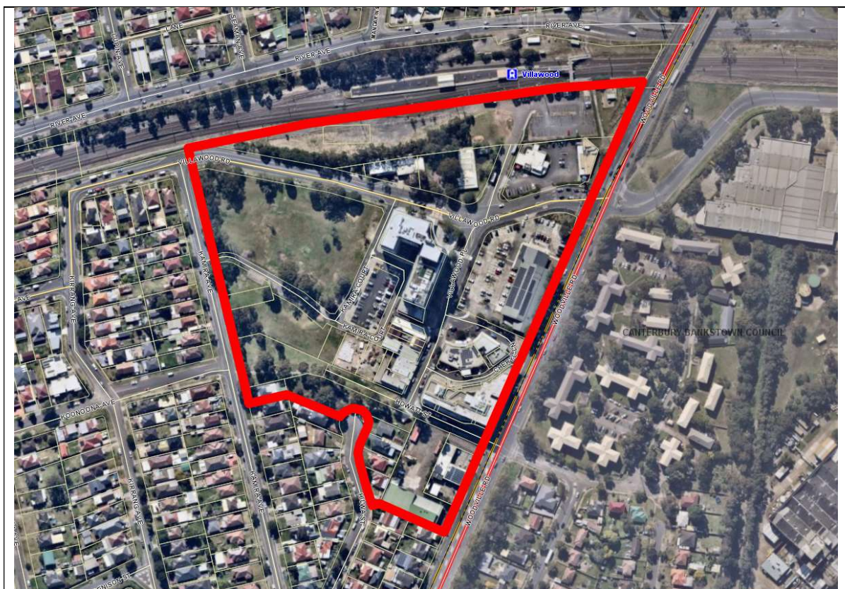
Figure 1. Villawood Town Centre – application of Town Centre DCP