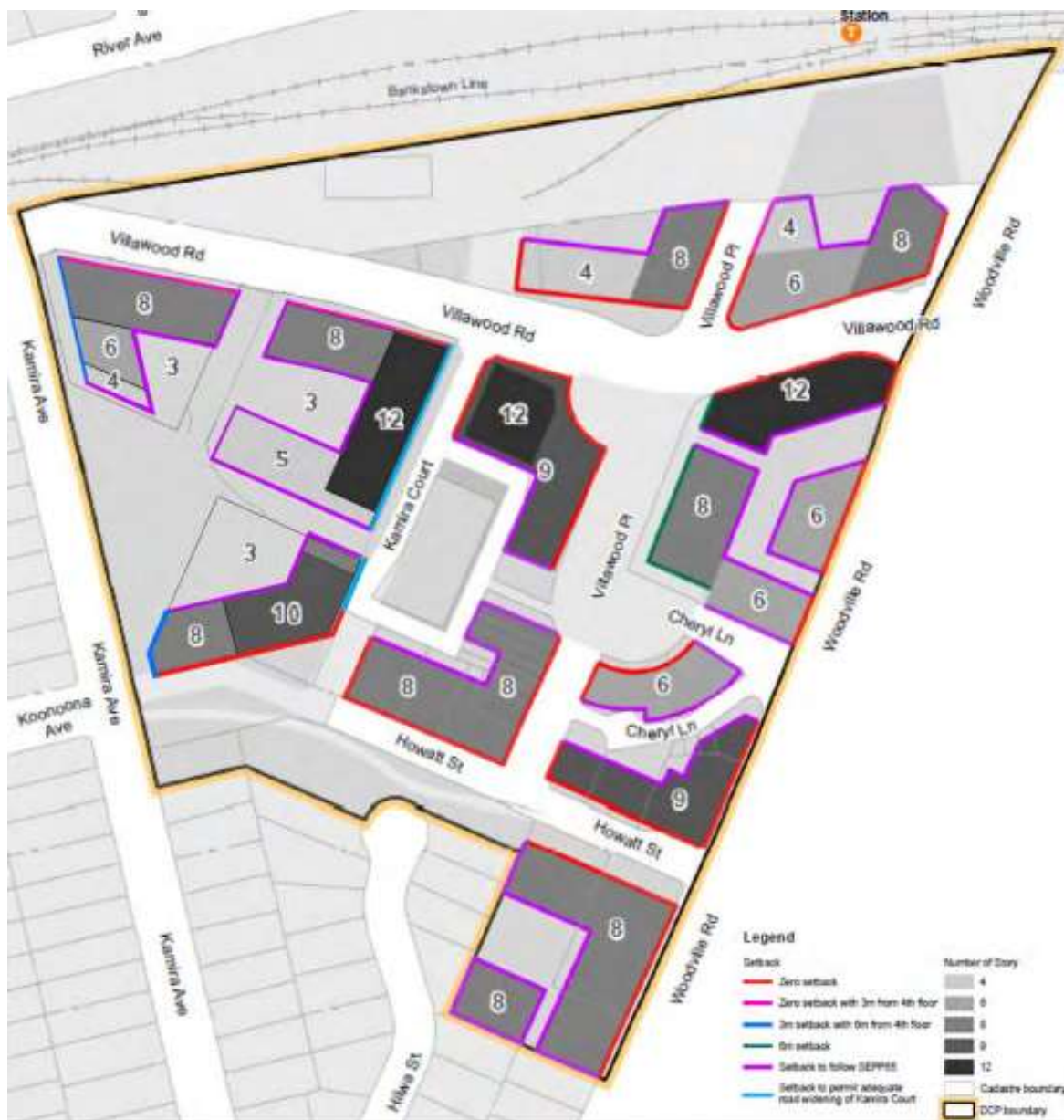
Figure 5. Villawood Town Centre - Setbacks