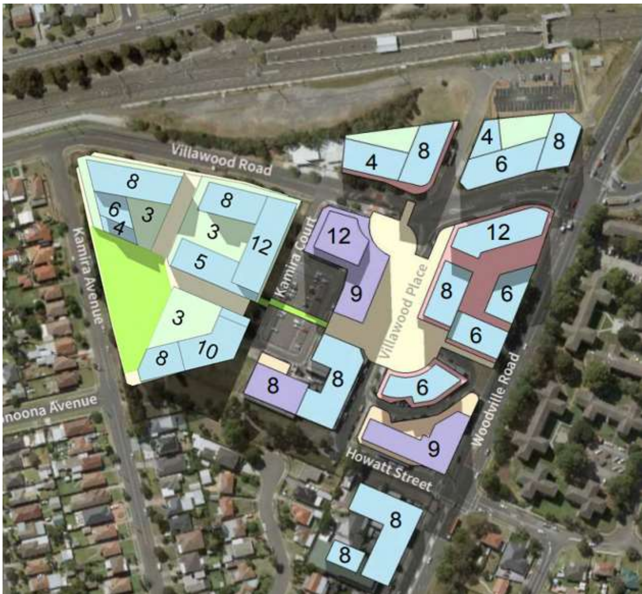
Figure 4. Maximum height of building and storeys in Villawood Town Centre